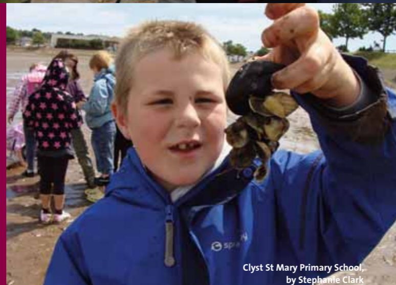
Clyst St Mary Primary School

Local schools will be invited to book onto next year's free educational trips in early spring. Since these sessions prove to be very popular, schools are advised to book early to avoid disappointment.