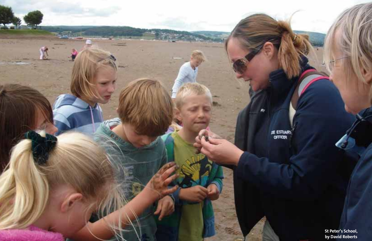
St Peter's School

During the warmer months, the Exe Estuary Partnership helped local schools make the most of the Exe with free educational trips on the estuary. Schools were able to choose from two exciting experiences, both allowing children to participate in discussions and activities to learn about this incredible environment.