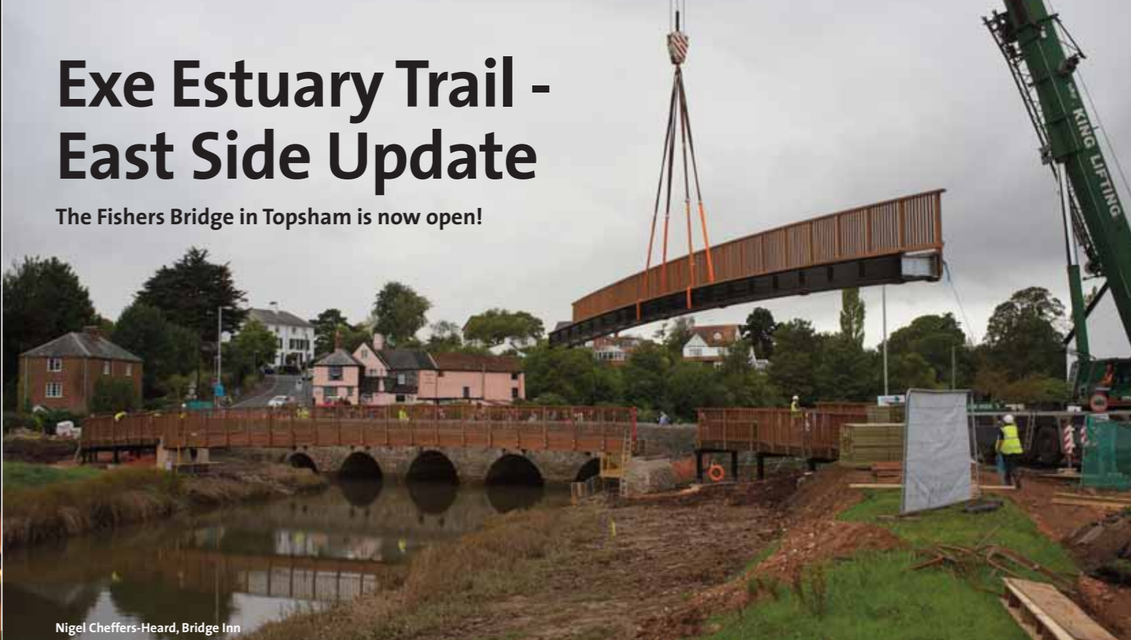
Nigel Cheffers-Heard, Bridge Inn

The Fishers Bridge in Topsham is now open!