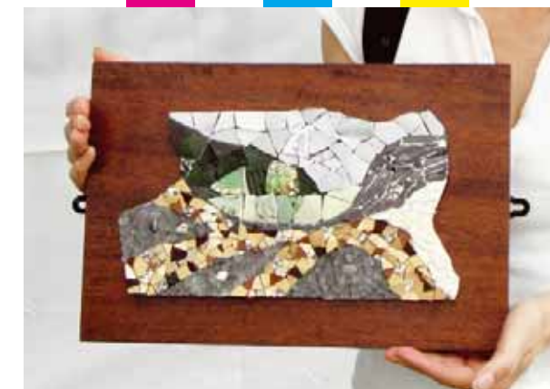
First Prize in adult competition