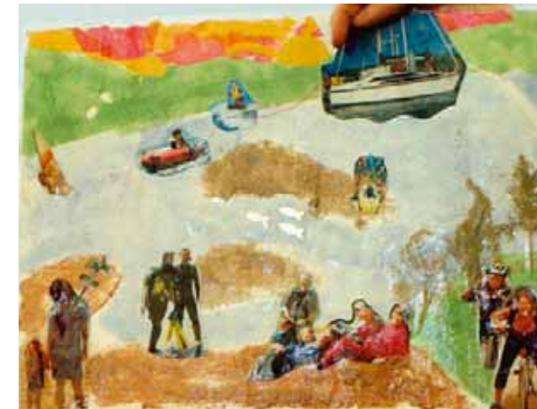
First Prize in Children's category