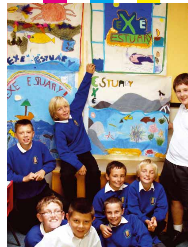
Littleham Primary school with their entries