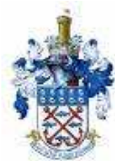
Exmouth Town Council