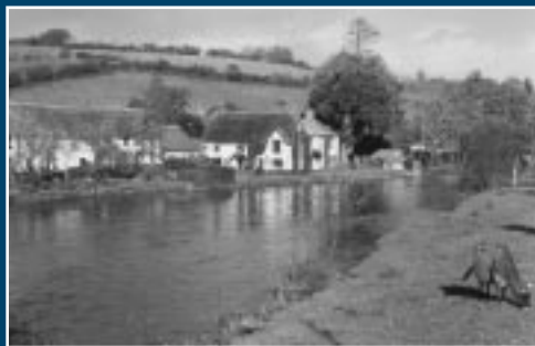
The River Exe at Bickleigh

There are so many cycles within cycles in the Exe catchment that this leaflet cannot go into detail – a simplified version is given.