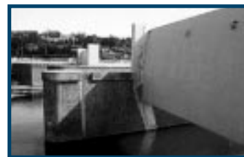
Radial gates, Exeter flood relief channel