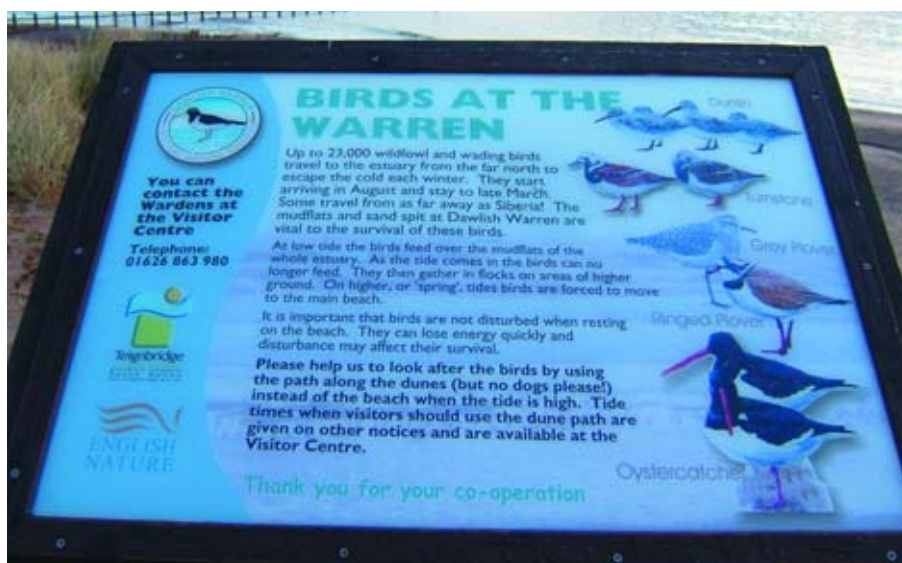
Image 6e: Interpretation board on the Exe Estuary

The presence of interpretation boards and information signs around the Estuary is another effective way to provide an education resource for the people who use the Exe. There are currently a variety of boards and signs positioned at access points on the Estuary. Some are used to relay information about the estuarine environment and how to protect the sensitive ecosystems, whilst others outline byelaws or provide safety advice. However, the risk of relying on sign boards alone to relay important information is that they may not always be read by all target audiences.