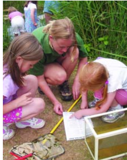
Image 6d: Investigating the ponds at Dawlish Warren