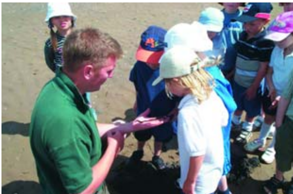
Image 6a: Outdoor education at Exmouth LNR

500 children were taken out on the Exmouth Local Nature Reserves between March and August 2004.