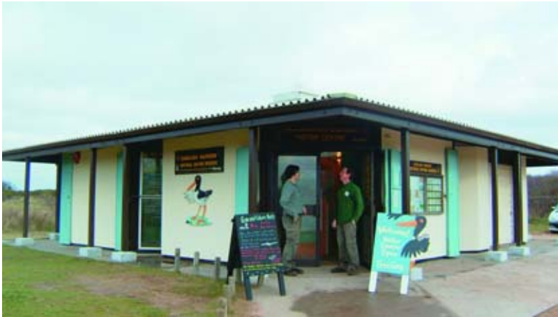
Image 6c: Dawlish Warren Visitor Centre

In 2004, the Dawlish Warren Visitor Centre underwent a successful renovation. The centre is a great asset to local communities and schools through its educational initiatives and access to information.