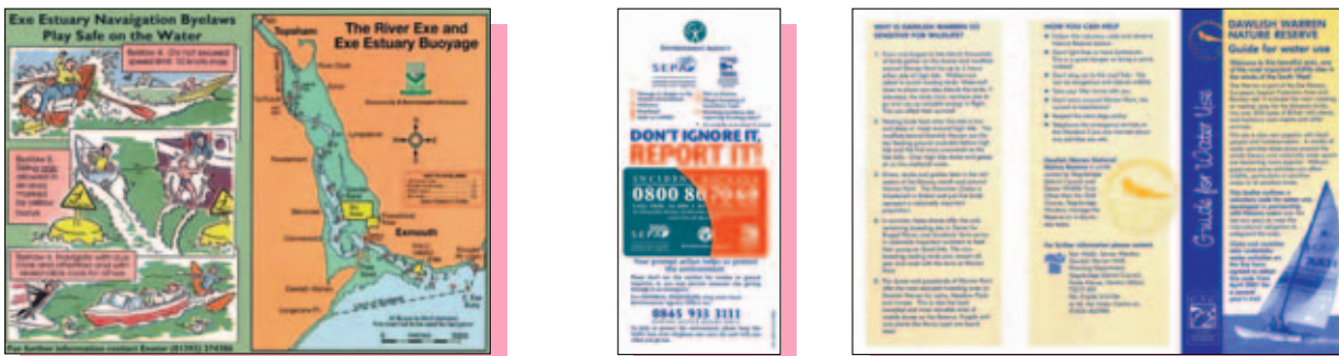
Image 6f: Selection of Exe Estuary promotional and advisory materials

The Exe Estuary has also been the subject of numerous books, ranging from watercolour and nature books, to historic accounts of the Exe. There is a selection of publications and information leaflets on the Exe, and the Exe Estuary website ( www.exe-estuary.org ) provides up to date estuary-related news and links.