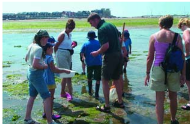
Image 6b: Exploring Exmouth LNR